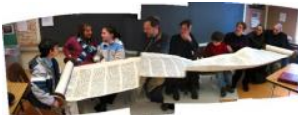
Adat Shalom (Bethesda, MD) congregants with Torah unfurled.

Following a successful inaugural year, these free distance-learning classes will provide relevant information and strategies beneficial to congregational leaders and staff. In the context of the present economic crisis, expert speakers will partner with JRF staff and lay leaders with the objectives to keep congregations and havurot strong; grow leadership and continue critical tikkun olam work. Specific classes include: Dynamics of Growth, Embracing Change, Outreach + Marketing, Values-Based Budgeting, Sustainability, Money & Spirituality, Fundraising, Community Organizing and more. Participation is via phone classes and webinars.